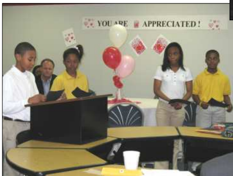
School board members touch many lives. These Canton School of Arts & Sciences students say thanks for all of your hard work!