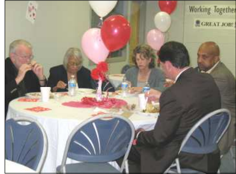
To show its gratitude, the District surprises the Board with an Appreciation Luncheon complete with inspirational entertainment and words of thanks.